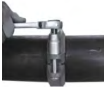
6. Tighten Nuts

Remove one bolt&nut and loosen the other nut. Place one housing over the gasket, making sure the housing keys fit into the pipe grooves. Swing the other housing over the gasket and into the grooves on both pipes. Re-insert the bolt and connect two housings.