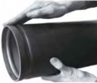
1. Pipe Preparation

Check pipe end for proper groove dimensions and to assure that pipe end is free of indentations and projections that would prevent proper sealing.