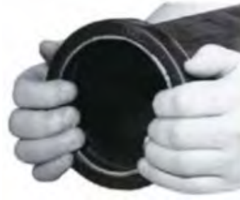
3. Gasket Installation

Check gasket to be sure it's compatible for the intended service. Apply thin lubricant to the outside and sealing lips of the gasket.