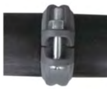
7 a. Assembly completed - Rigid Coupling

Check gasket to be sure it's compatible for the intended service. Apply thin lubricant to the outside and sealing lips of the gasket.