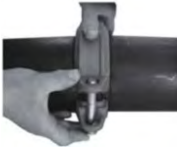
5. Housing Installation

After aligning two pipe ends together, pull the gasket into position, centering between the grooves on each pipe. The gasket should not extend into the groove on either pipe.