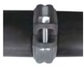
7 b. Assembly Completed - Flexible Coupling

Slip the gasket over one pipe, making sure the gasket lip does not over-hang the pipe end.