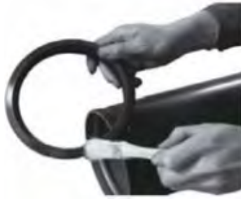
2. Lubricate Gasket

Check pipe end for proper groove dimensions and to assure that pipe end is free of indentations and projections that would prevent proper sealing.